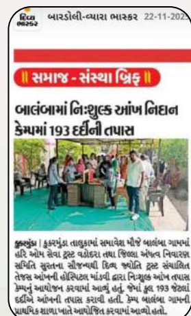
Balamba camp Press note