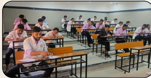
Theory exam of Ophthalmic assistant team