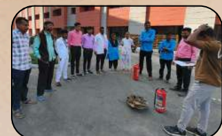
Code red team training