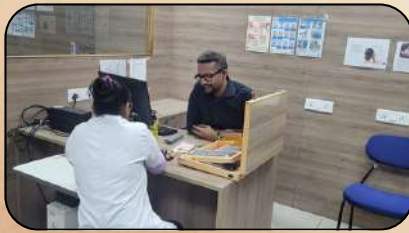
Practical exam of Ophthalmic assistant team