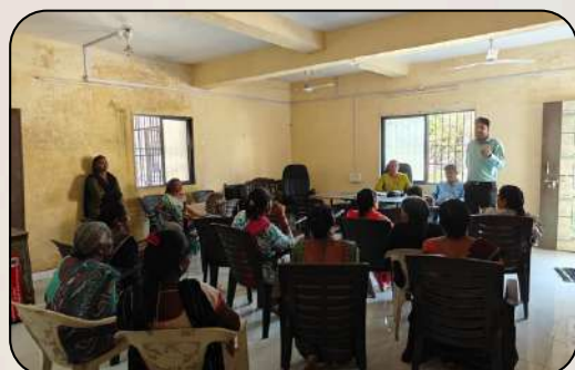
Kharwasa (Bardoli Vision centre) community meeting