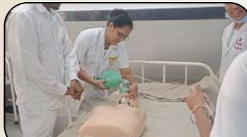
Code blue team training