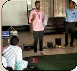
Code RED training during staff meeting