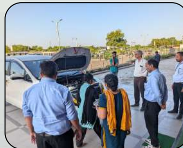
Procurement of new Innova crysta car